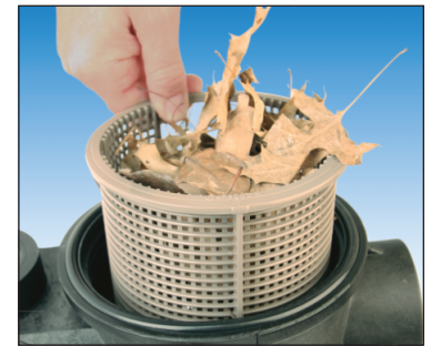
Super II 155-Cubic-Inch (2500cc) Basket

is more like a bucket. The Super II Pump Series features impressive leaf-holding capacity. Rigid construction includes load-extender ribbing for free-flowing operation, even under extra-heavy debris loads.